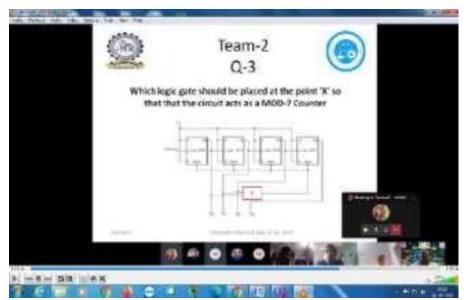
Quiz Question asked via Microsoft team