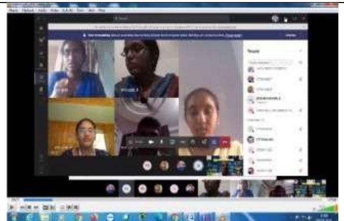
Participants in Online oral quiz