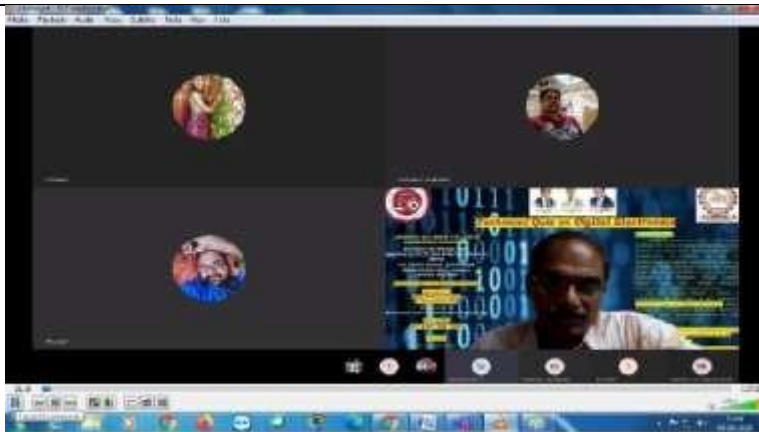
Address by ISTE Student Chapter Coordinator