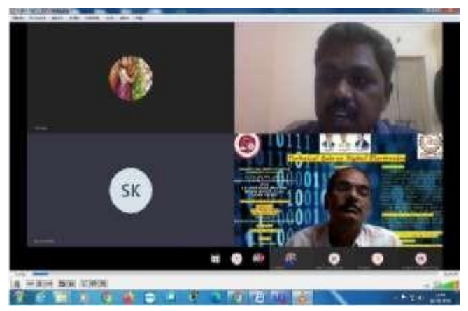
Address by HOD